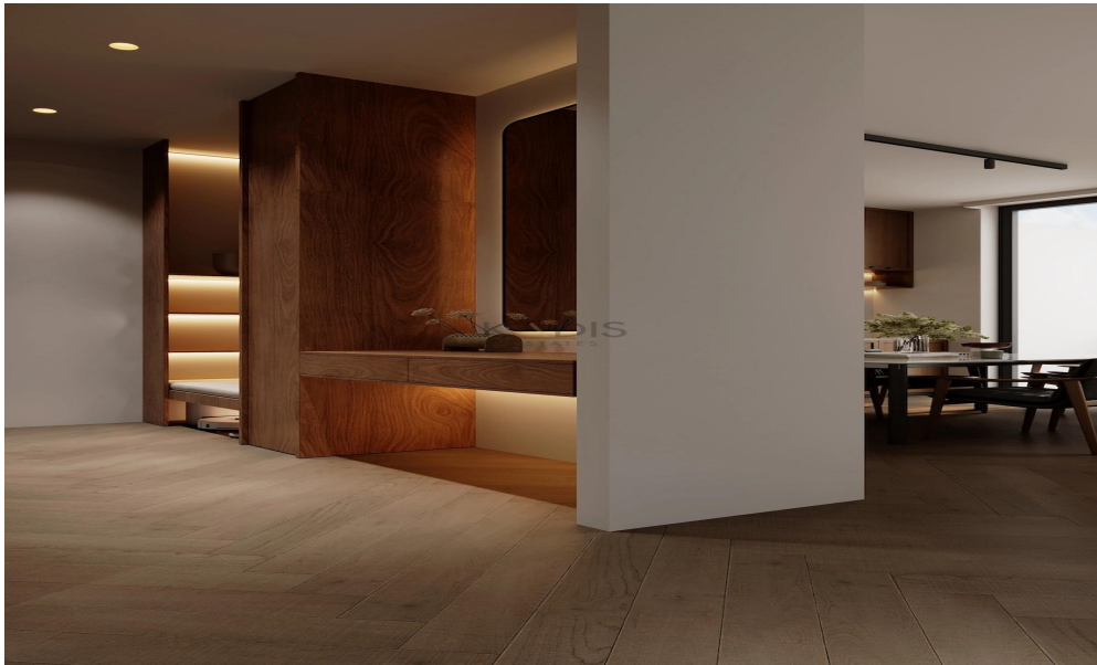
| GROUND FLOOR