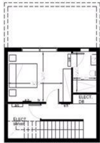
BASEMENT USABLE AREA= 41sqm