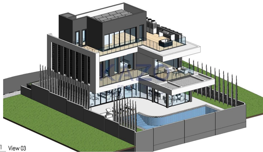
1 View 03 13