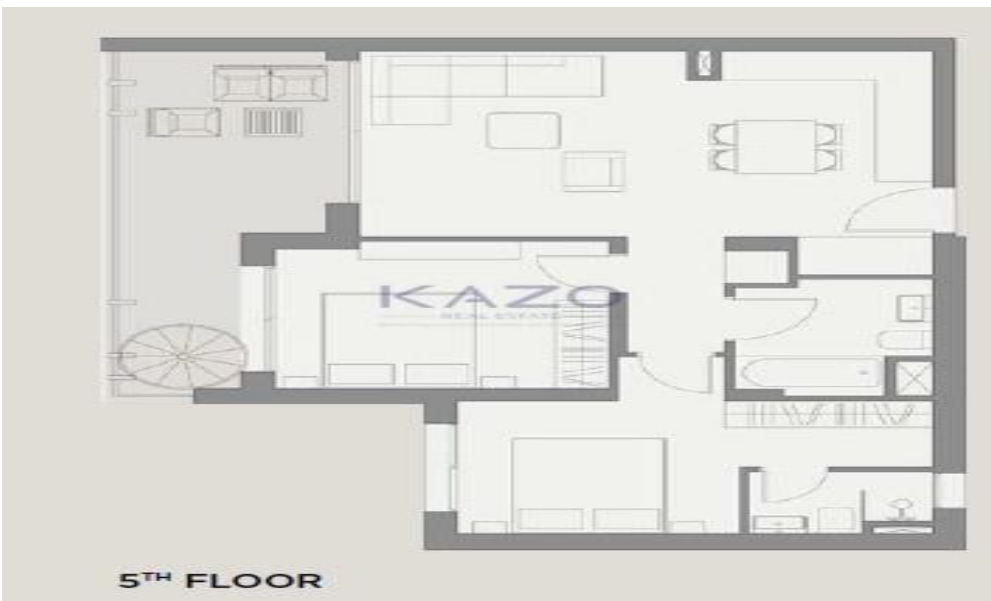
5 TH FLOOR