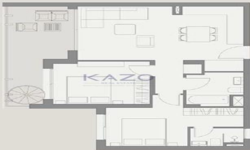
5 TH FLOOR