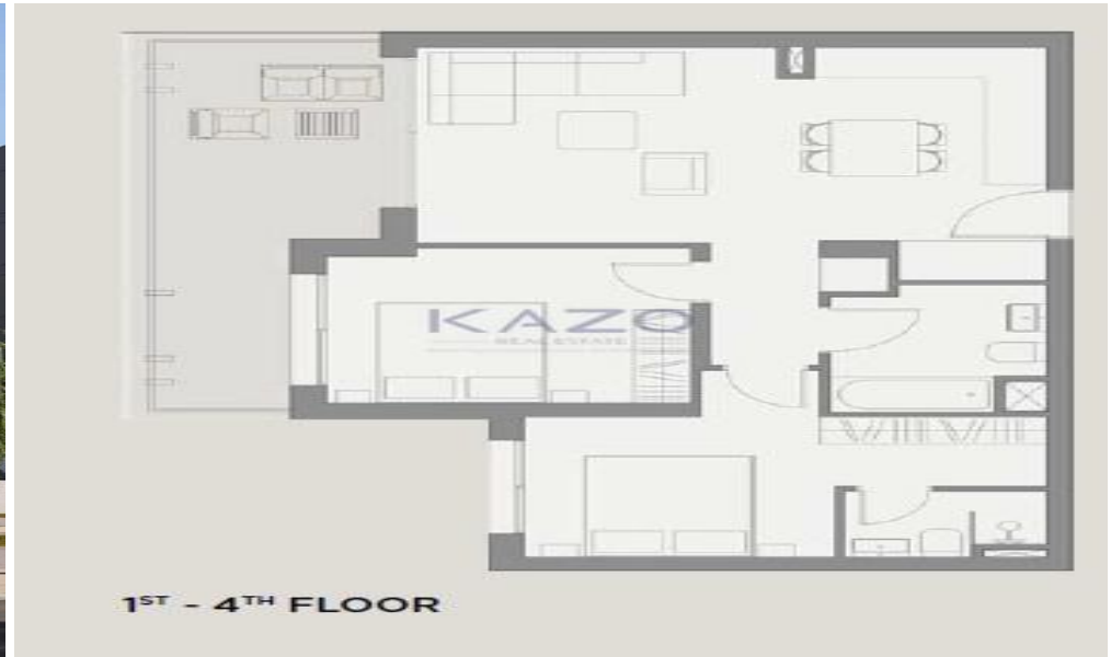
1 ST - 4 TH FLOOR