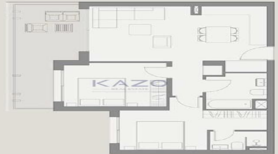
1 ST - 4 TH FLOOR