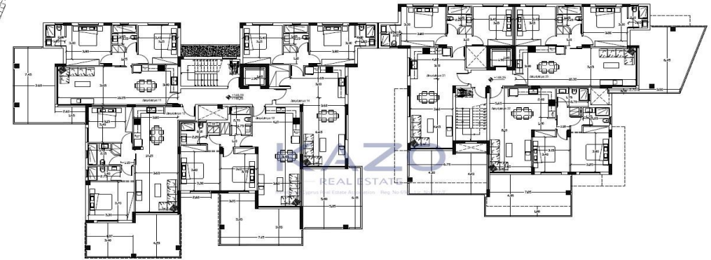
1st Floor - 2nd Floor