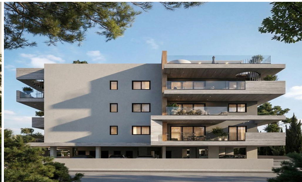
BLOCK B - THIRD FLOOR