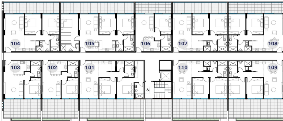
BLOCK B2 . B3 GROUND & 1ST UPPER FLOORS