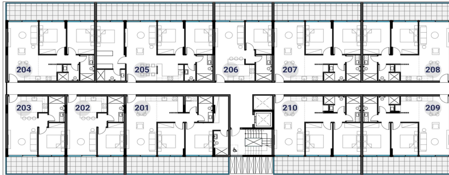
BLOCK B2 . B3 2ND UPPER FLOORS