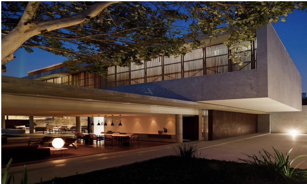
• Villa 1 - Basement