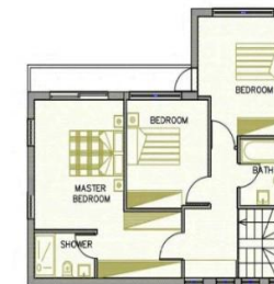
ΚΑΤΟΨΗ ΟΡΟΦΟΥ HOUSE 1