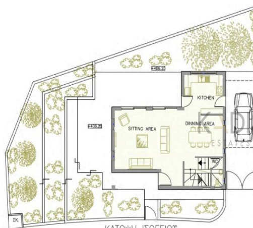
ΚΑΤΟΨΗ ΙΣΟΓΕΙΟΥ HOUSE 1