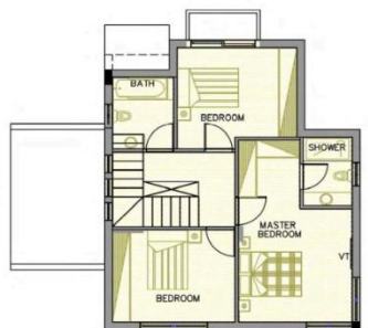
ΚΑΤΟΨΗ ΟΡΟΦΟΥ HOUSE 3