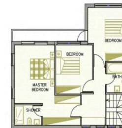
ΚΑΤΟΨΗ ΟΡΟΦΟΥ HOUSE 1