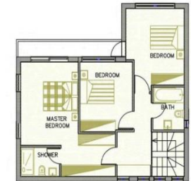
ΚΑΤΟΨΗ ΟΡΟΦΟΥ HOUSE 1