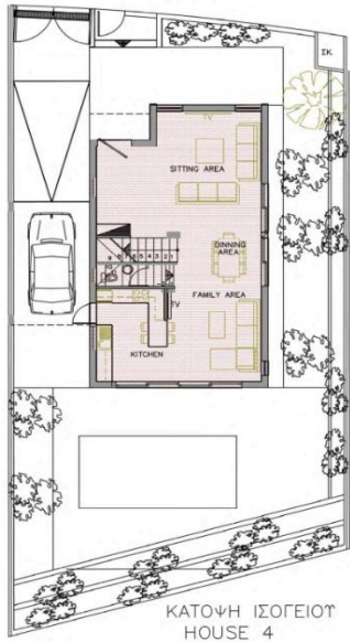
ΚΑΤΟΨΗ ΙΣΟΓΕΙΟΥ HOUSE 4