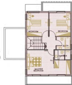
ΚΑΤΟΨΗ ΟΡΟΦΟΥ HOUSE 4