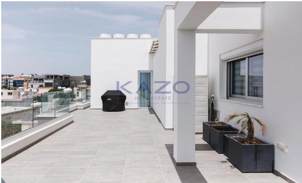
401 - 3 bedroom penthouse