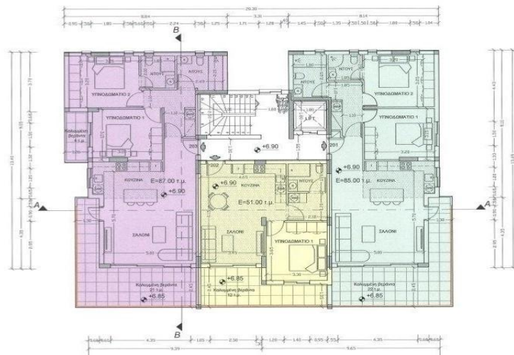
KATOPH 2ου ΟΡΟΦΟΥ ΚΑΜΑΚΑ 1:100