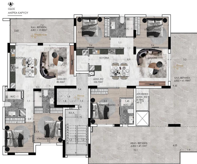
ΚΑΤΟΨΗ 3ου ΟΡΟΦΟΥ / 3rd FLOOR