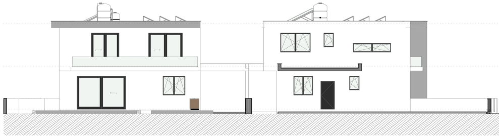
House 1 and 2