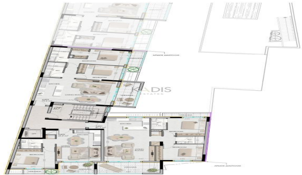
4TH FLOOR PLAN - BLOCK A