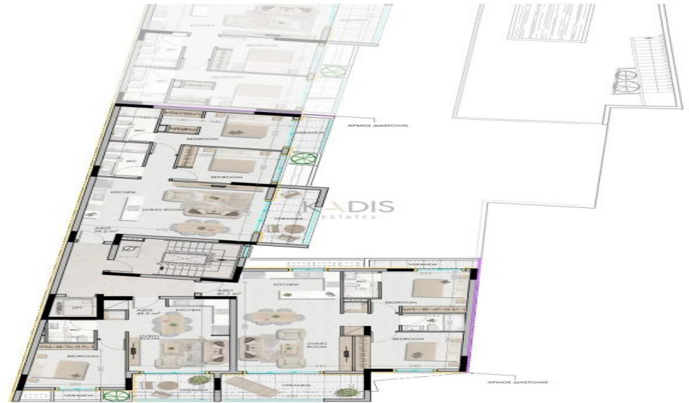
2ND FLOOR PLAN - BLOCK A