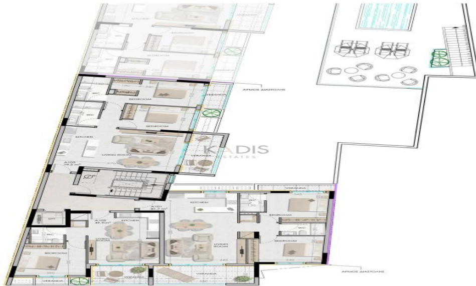
1ST FLOOR PLAN - BLOCK A