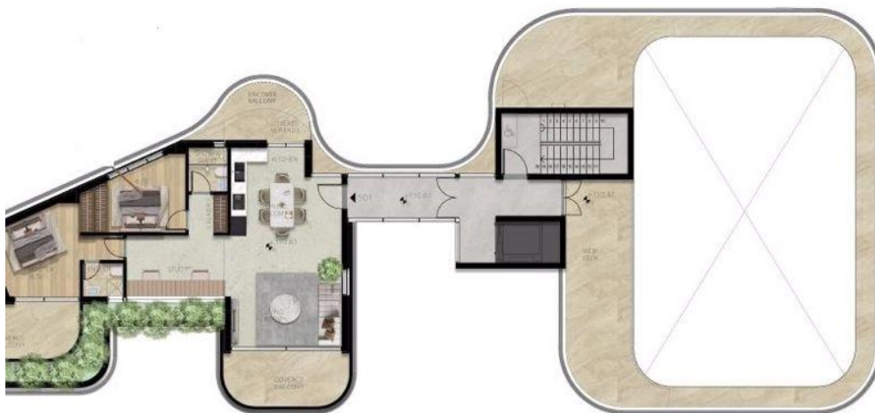
Fifth Floor - Plans - Area