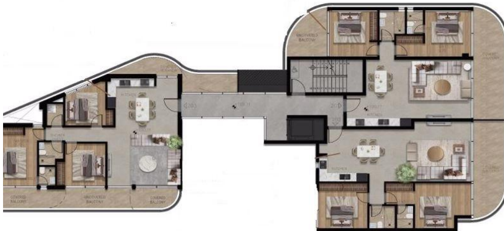
Second Floor - Plans - Area