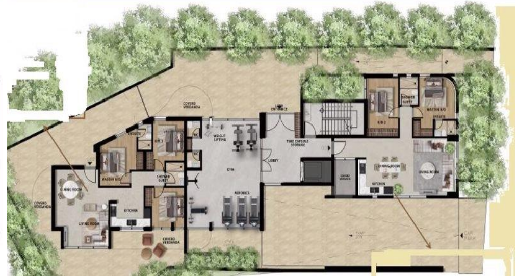
Ground Floor - Plans - Area