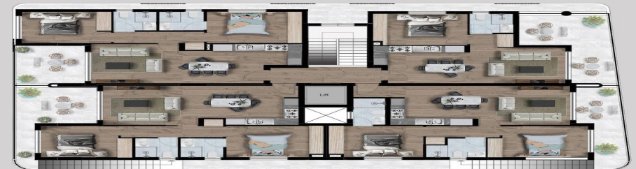
Block B KALOGIROU