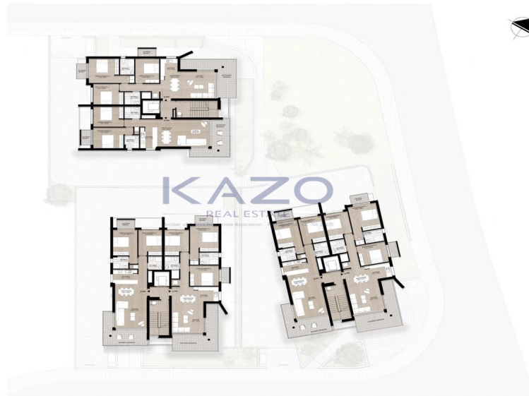
ΚΑΤΩΦΗ 2 ου ΟΡΟΦΟΥ