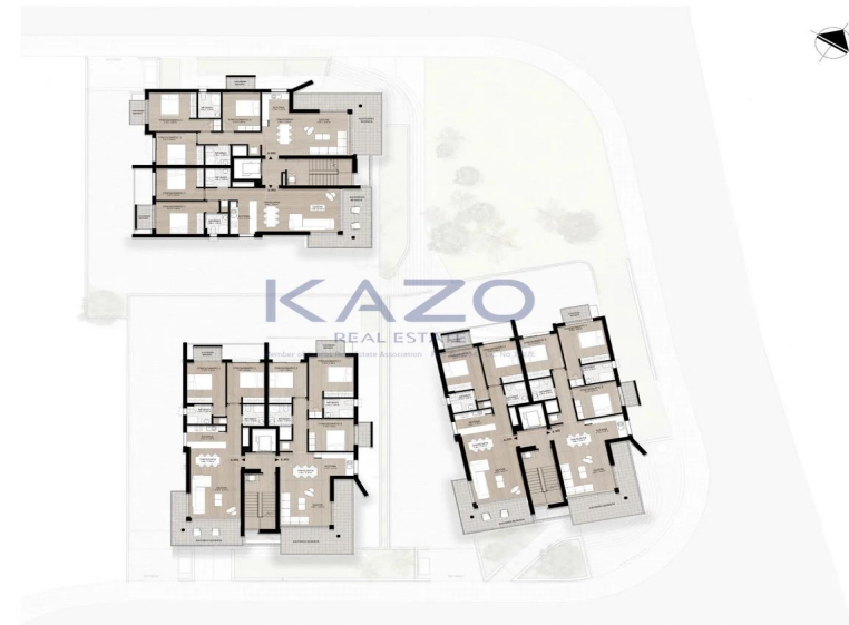
ΚΑΤΩΦΗ 3 ου ΟΡΟΦΟΥ