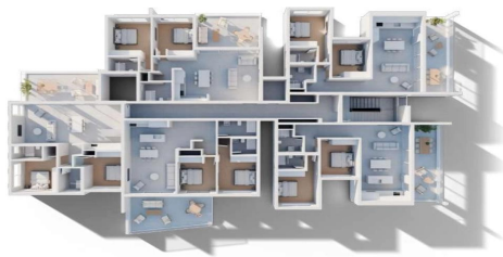
LEVEL 1 & 2