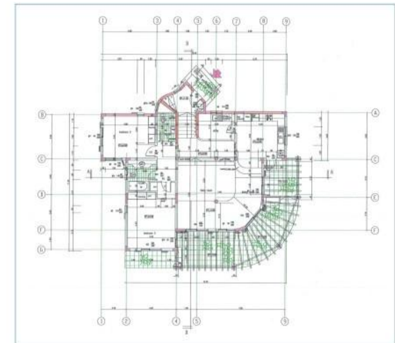
PRELIMINARY GROUND FLOOR PLAN