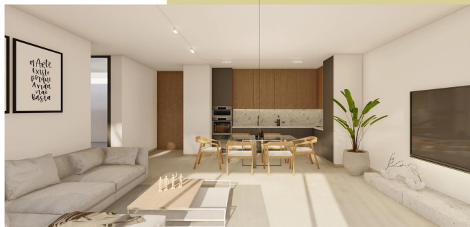
KITCHEN & LIVING ROOM