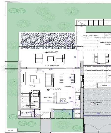
GROUND FLOOR PLAN SC:1:100