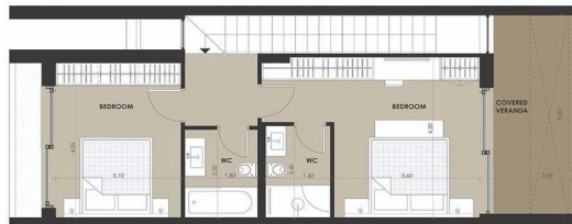
■ 1ST FLOOR