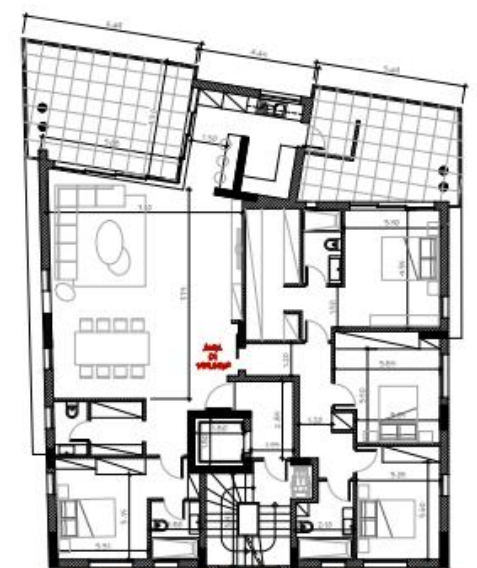
FLOOR PLANS [1st-4th Floor] - 4 BEDROOMS FLATS