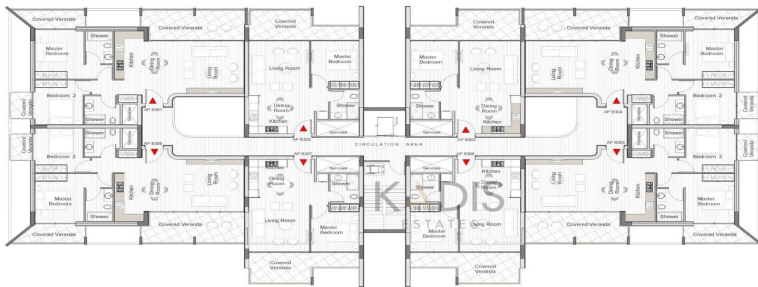
A004-BLOCK B THIRD FLOOR 1:100