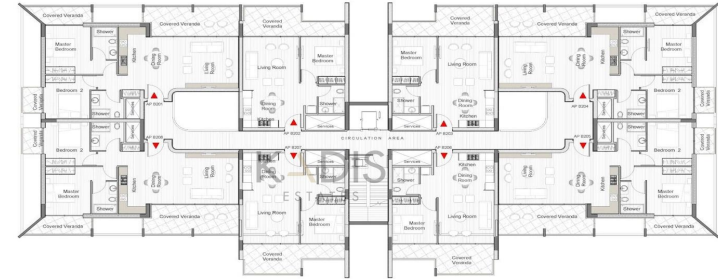
A003-BLOCK B SECOND FLOOR 1:100