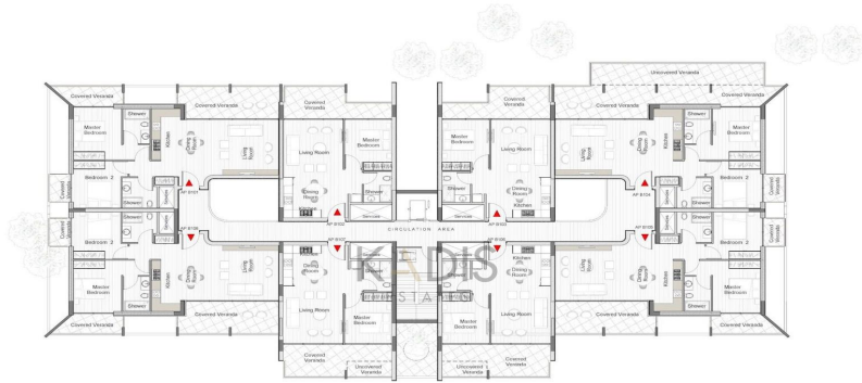
A002-BLOCK B FIRST FLOOR 1:100