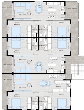
Green Valley_BLOCK 2 First-Interior Design