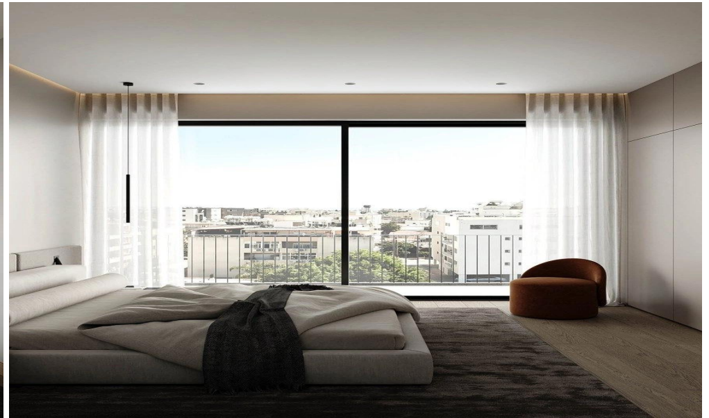
Aalto 4th Floor