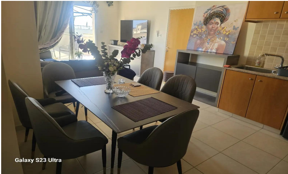
Galaxy S23 Ultra