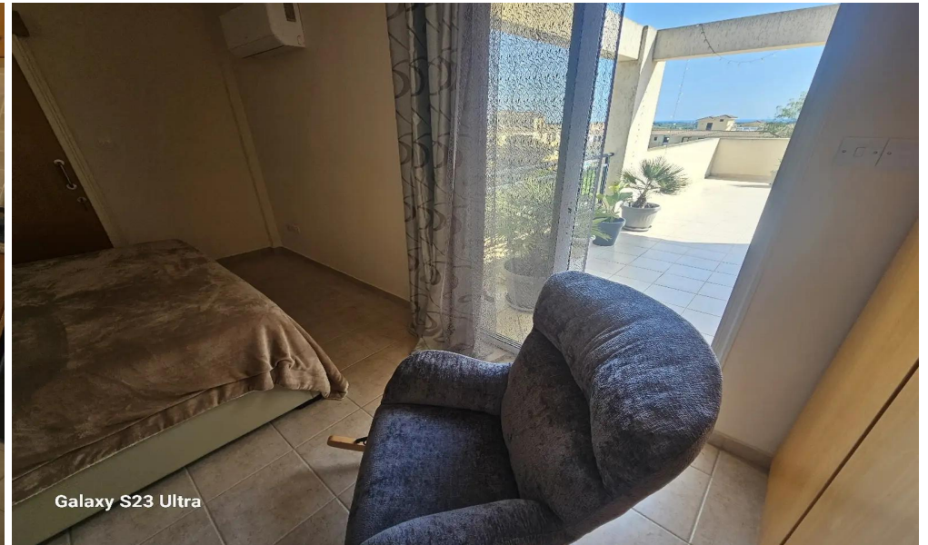
Galaxy S23 Ultra