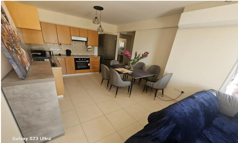
Galaxy S23 Ultra