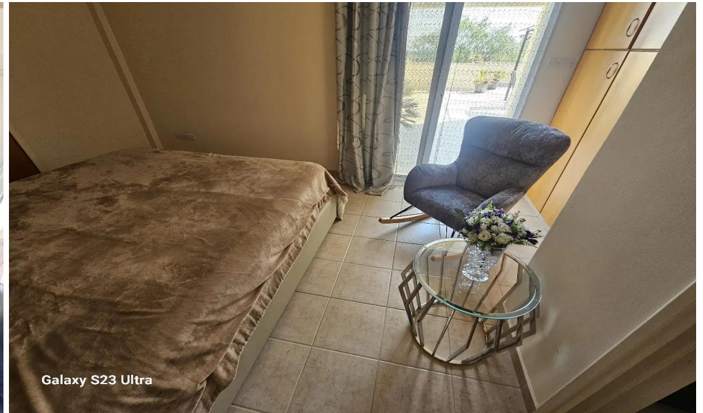
Galaxy S23 Ultra