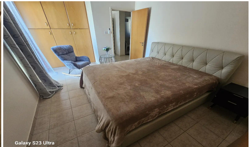
Galaxy S23 Ultra