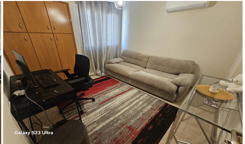
Galaxy S23 Ultra