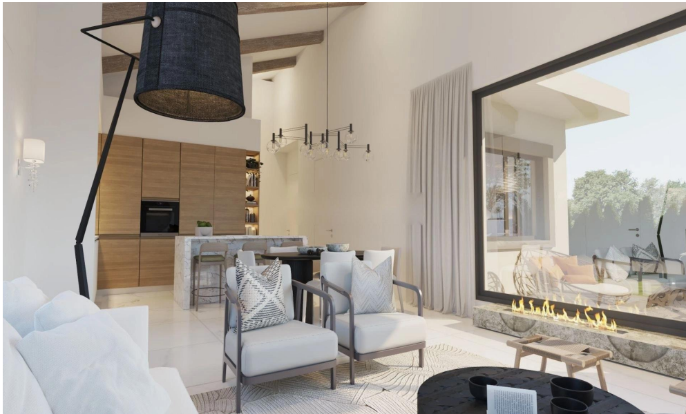
Κατοικία 7 TYPE A